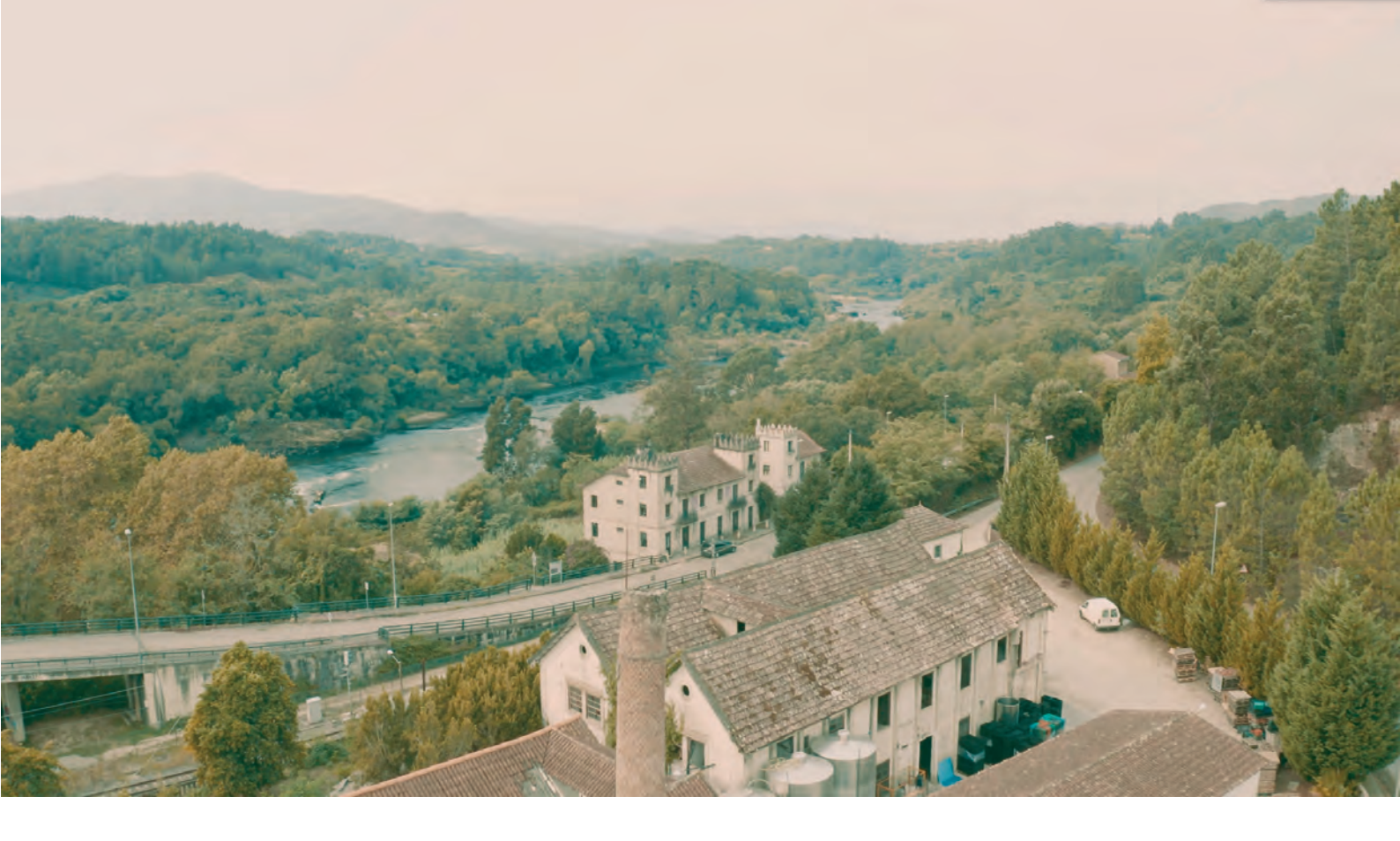
Our wineries are located in a historic building from the beginning of the last century..